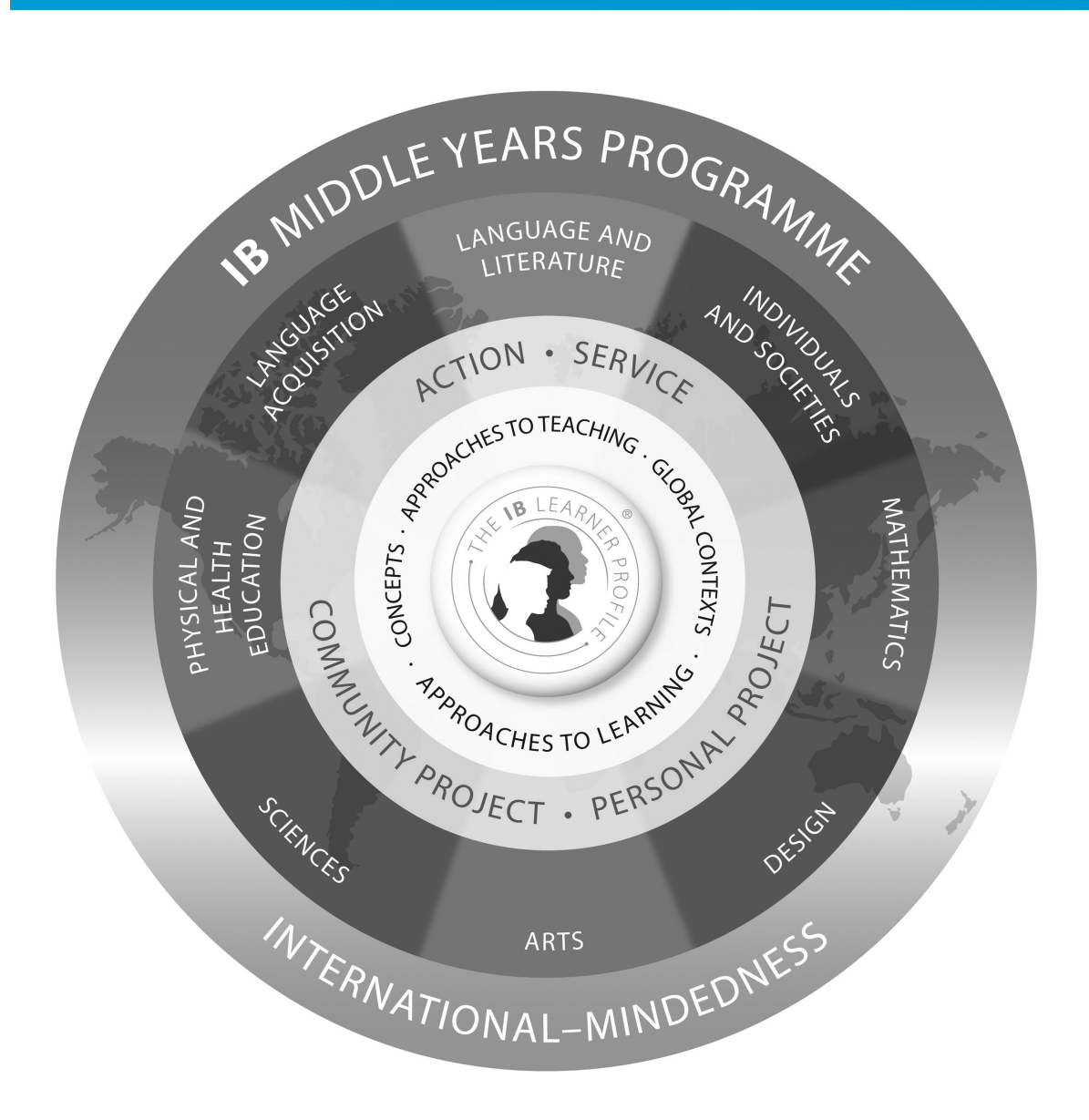
Figure 1 Middle Years Programme model

The MYP is designed for students aged 11 to 16. It provides a framework of learning that encourages students to become creative, critical and reflective thinkers. The MYP emphasizes intellectual challenge, encouraging students to make connections between their studies in traditional subjects and the real world. It fosters the development of skills for communication, intercultural understanding and global engagement—essential qualities for young people who are becoming global leaders.