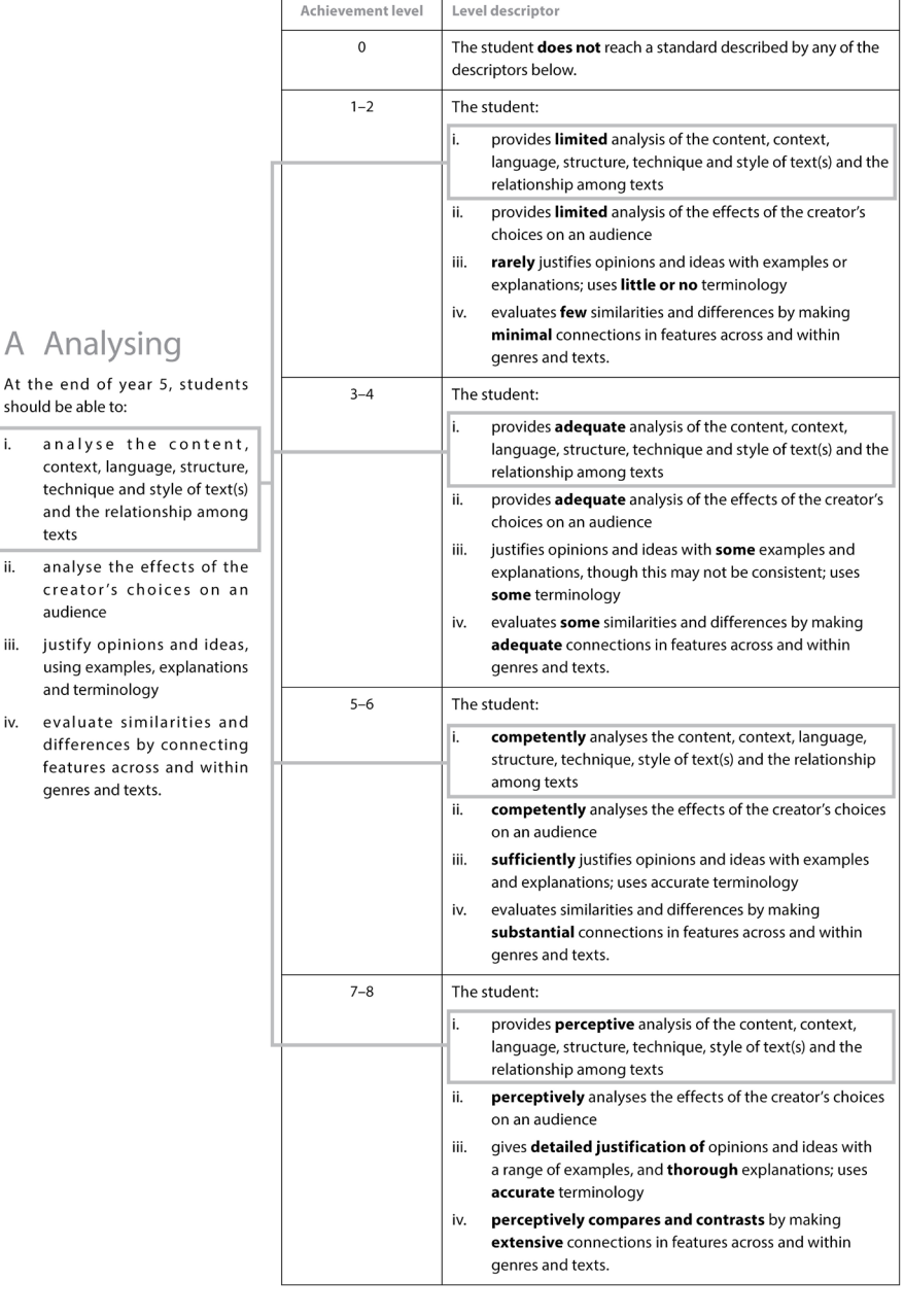
Figure 3 Language and literature objectives and criteria alignment

In the MYP, assessment is closely aligned with the written and taught curriculum. Each strand from MYP language and literature has a corresponding strand in the assessment criteria for this subject group. Figure 3 illustrates this alignment and the increasingly complex demands for student performance at higher achievement levels.